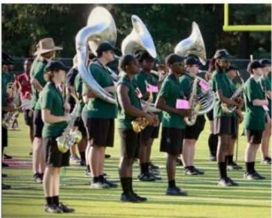
Woodwinds & Brass