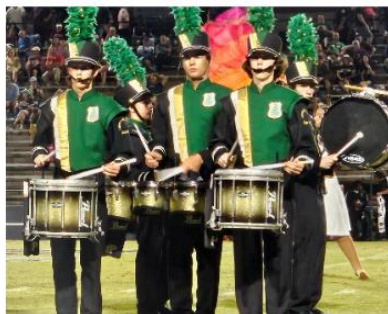
Drumline & Front Ensemble