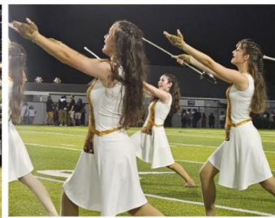
Dance, Flag, Rifle, Sabre